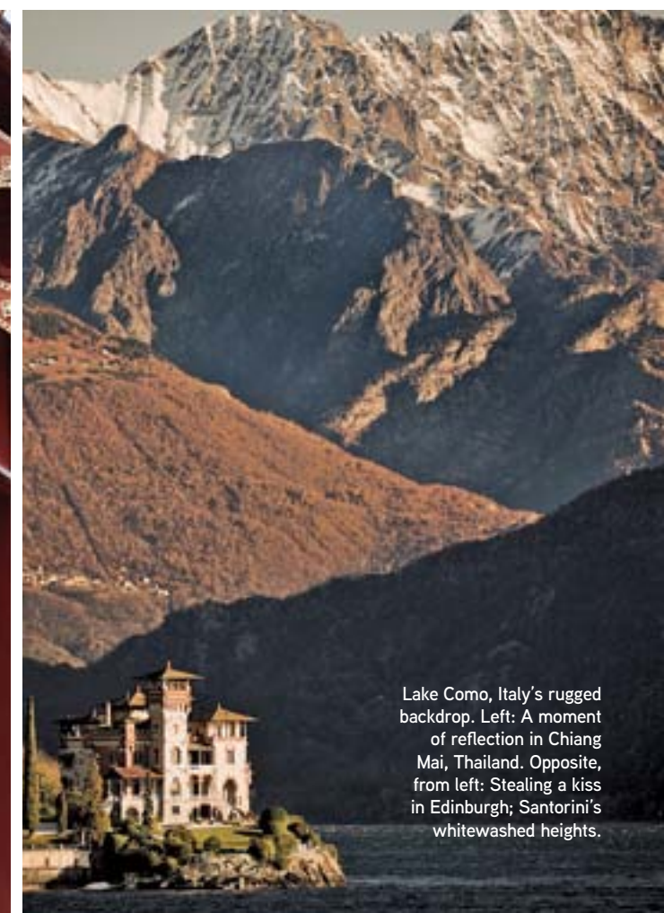
Lake Como, Italy’s rugged backdrop. Left: A moment of reflection in Chiang Mai, Thailand. Opposite, from left: Stealing a kiss in Edinburgh; Santorini’s whitewashed heights.